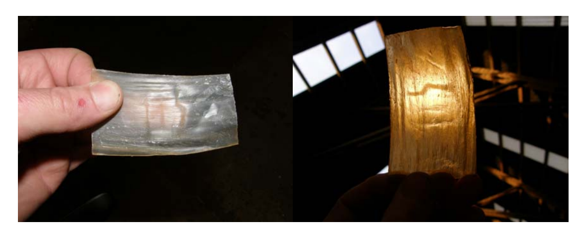
The thinnest piece - sadly not quite by design!