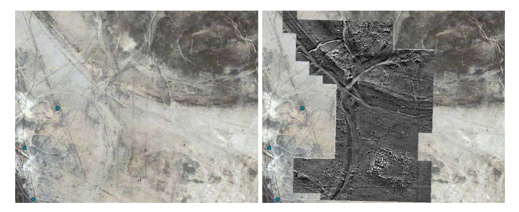
Figure 3: Left: IKONOS satellite image September 2001. Detail of the southern area. Right: Compilation of the satellite image with the magnetograms from March 2001 and 2002. Caesium magnetometry, Scintrex Smartmag SM4G-special, sensitivity 0.005 nT, dynamics -+12.00 nT in 256 grey scale (white/black), raster 0.5 x 0.1 m (interpol. 0.25 x 0.25 m), 40m grid.

The aim of the magnetometry at Uruk was primarily to verify features visible on the aerial photos from 1935 as water canals (see the right edge of figure 3). These canals are also very clearly visible in the satellite images, which gives the extrapolation of the limited "magnetic" area to an almost complete map of the water streets of Uruk. The very clear plan of an Ur III palace in the magnetogram of figure 3 is caused by the high magnetization of the baked bricks used for this architecture. The red colour in the multispectral satellite image also led to the conclusion that this is a building made from baked bricks. The aerial photo also shows some walls of this Ur III palace as shadow marks. Both images could be sharpened by the "magnetic" channel. Two more buildings on the other side of a street are only visible in the magnetic image.